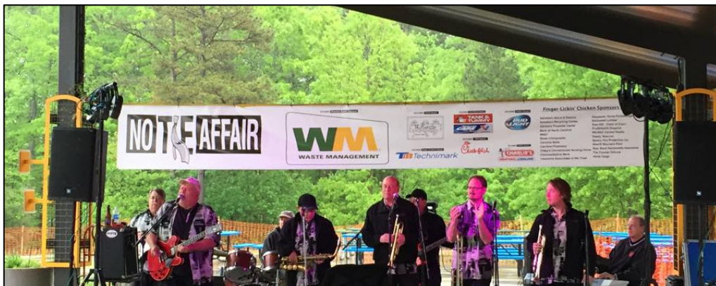
One of the "fun events" sponsored by the Asheboro Randolph Chamber is the No Tie Affair.

The Asheboro Randolph Chamber of Commerce has retained The Chason Group, an executive search firm specializing in chambers of commerce, to lead the recruitment process. Candidates interested in applying for the President and CEO position may upload a cover letter and a copy of their resume at www.thechasongroup.com . All cover letters and resumes must be received no later than April 17, 2024. The most qualified candidates will receive a detailed application to complete prior to the interview process. The start date for the position is June / July 2024.