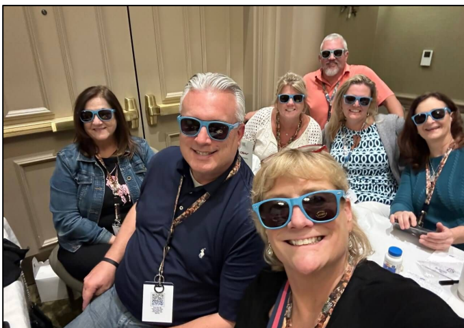
Chamber members prepare the Chamber's Annual Plan of Action.

The President and Chief Executive Officer is responsible for all aspects of operations for the Asheboro Randolph Chamber of Commerce, as well as the Chamber Foundation, and reports directly to the Board of Directors through an annually elected Chair. The professional provides vision, strategic direction, and management for the programs and personnel of the organization. The leader demonstrates expertise in strategic planning, program and personnel management, member sales and services, resource development, nonprofit governance and operations, financial management, marketing, public policy and advocacy, and community, economic, and workforce development.