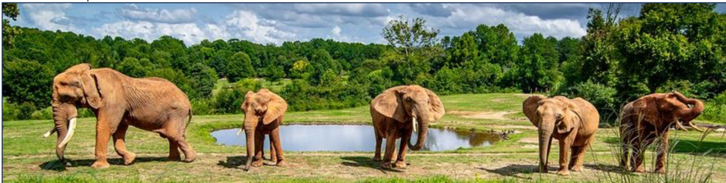
The North Carolina Zoo is one of the largest natural-habitat zoos in the world and home to hundreds of animals from North America and Africa.