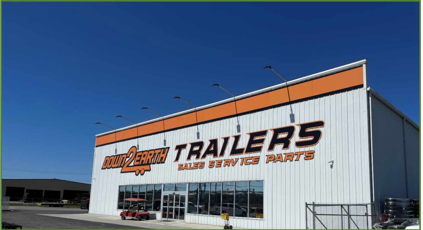
Down2Earth Trailers is one of the products manufactured in Appling County.