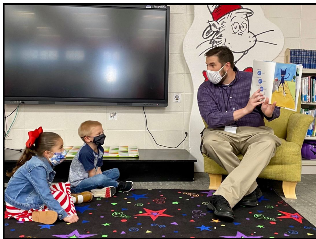
camp for Middle School students), and Government Affairs.