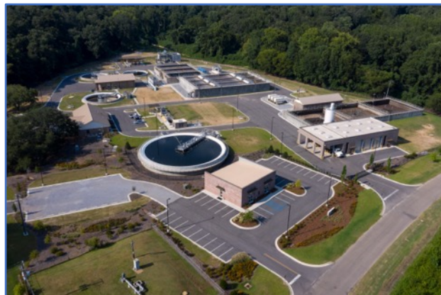
The City of Prattville has significant water and sewer capacity due to foresight by community leaders.

The Director of Economic Development. The Economic Development Director is responsible for directing and facilitating inclusive and strategic economic development initiatives to grow and maintain jobs and increase the tax base in the City of Prattville and surrounding areas. The professional is accountable for both commercial and industrial recruitment and maintenance. Other responsibilities include: providing leadership and guidance to the City of Prattville's economic development team; oversight of all daily operations; and, in collaboration with the community, developing and implementing a strategic economic development plan on an annual basis. The Director represents the City of Prattville at meetings with clients and working with various partners.