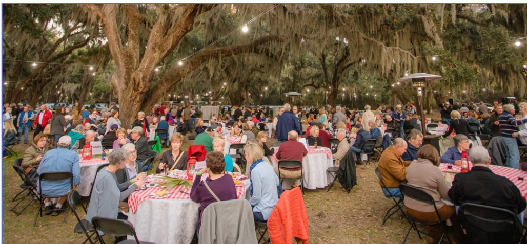
The annual SSLT Oyster Roast is a major fundraiser for the organization.